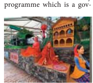
tableau features the homestay

ernment scheme that provides income generation opportunities to thousands of villagers. He further said that in the year 2023, the Central government declared Sarmoli village of Pithoragarh district of Uttarakhand as the best tourism village. Additionally, the Lakhpati Didi Yojana has played a significant role in promoting women's self-re-liance in the State, he added. Chauhan informed that the tableau of 'Viksit Uttarakhand' also showcases various initiatives such as the allweather road, the Rishikesh-Karnprayag rail project, ropeway and road connectivity to India's first village Mana. Such initiatives have greatly improved transportation facilities for the locals and visitors in Uttarakhand he said.